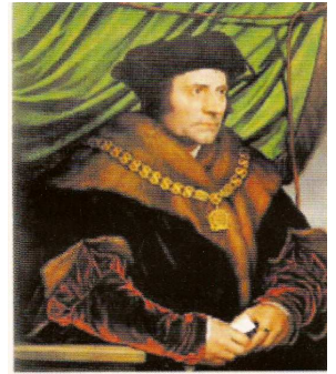
The Thomas More Society