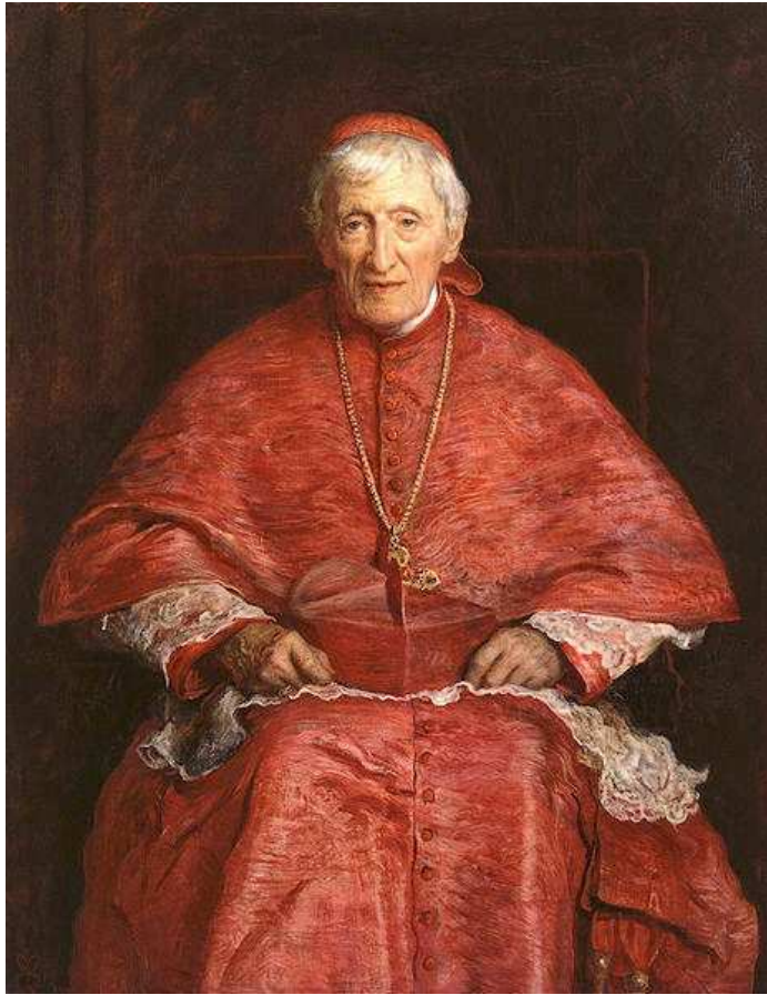
CARDINAL JOHN HENRY NEWMAN